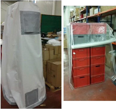
Bespoke Machine & Component Covers