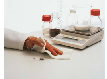
Technical Wipes - Low linting, Super Absorbent - polyester, poly/celulose, acid resistant