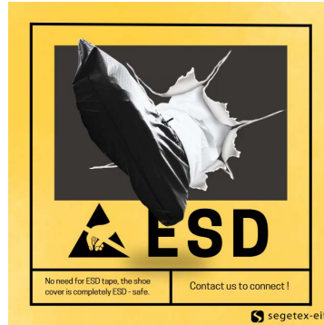
Anti-Static Discharge Shoe Covers