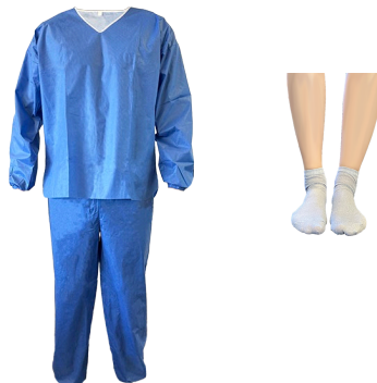
Low-linting base layer & socks