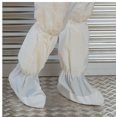
Specialist, non-slip shoe and Boot Covers